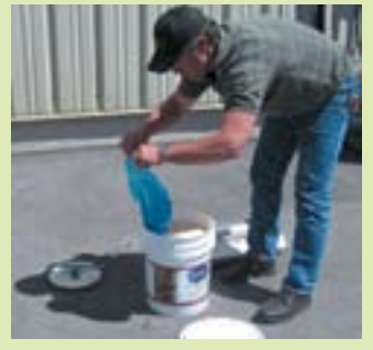
Remove the lid and the plastic liner from the pail