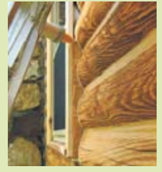
Fill the 3/8" gap between the surface of the foam and the edge of the frame with sealant