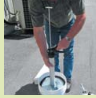
Ensure the tight seal, fully extend rod and fill the barrel. Disengage from the follow plate