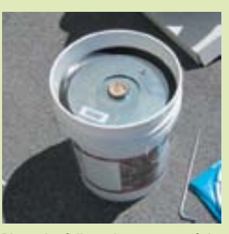
Place the follow plate on top of the chinking pail