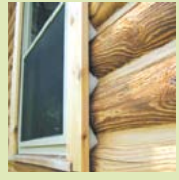
Insert foam blocks into void between logs and frame. Leave 3/8" gap between surface of foam and edge of frame