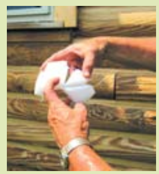
Cut triangular blocks of EPS or polyethylene foam