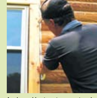
Apply masking tape to prevent sealant from smearing onto the adjacent logs