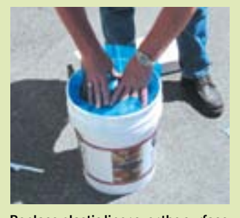
Replace plastic liner over the surface of the sealant