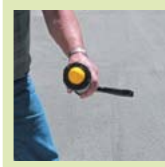
Attach the end cap and cone tip to the end of the barrel