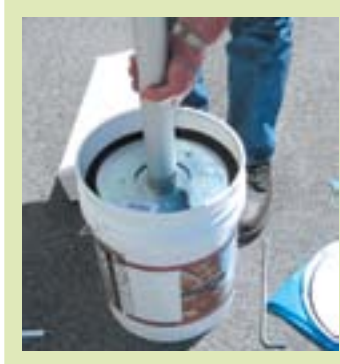
Remove the cap and cone tip from the gun barrel and push the end of the barrel onto the hole