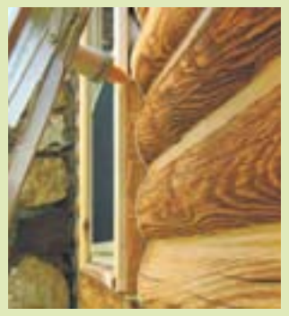
Fill the 3/8" gap between the surface of the foam and the edge of the frame with sealant