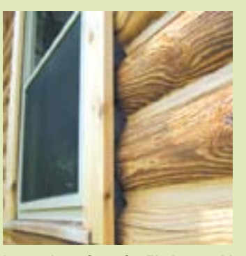
Insert Log Gap Cap<sup>™</sup> into void between logs and frame. Leave 3/8" gap between surface of foam and edge of frame