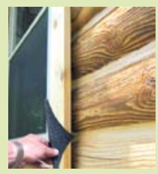
Use Log Gap Cap<sup>™</sup> where round logs meet window and door jamb trim

Avoid applying sealants in direct sunlight or when the temperature is less than 40^{\circ} F. In cold weather it's important that the logs be free of frost and dew in order to ensure that the sealant adheres tightly to the wood. Like stain, the best surface temperature range for easiest application and best results is between 50^{\circ} F and 80^{\circ} F.