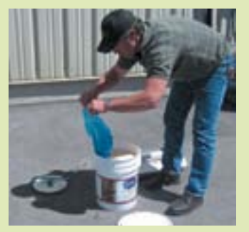
Remove the lid and the plastic liner from the pail