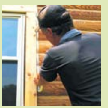
Apply masking tape to prevent sealant from smearing onto the adjacent logs