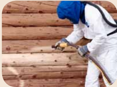
Corn Cob or Glass Blasting (Recommended method)

Prep the log surfaces using the method that will give you the finished appearance that you desire.