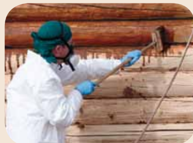
Immediately, vigorously back brush.