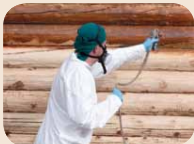
Spray on stain using a Graco #313 tip or equivalent.

Allow time for the PeneTreat® solution to dry, (usually 1-3 days depending on the weather—check the moisture content with a moisture meter) and then spray on—to the point of running—one heavy coat of Capture Log Stain. If only a brush is used, be sure to drench-apply the stain—don't skimp. Coat log ends multiple times to ensure the pores are sealed.