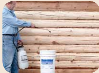
Apply Wood Preservative