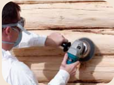
Osborn® Brush (Recommended method)

Hand finish the log surfaces to remove “felting” from power washing, once the logs are dry, or to lessen the texture caused from media blasting.