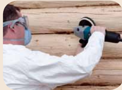
Sashco's Buffy Pad™ System or 3M® Non-woven Pad