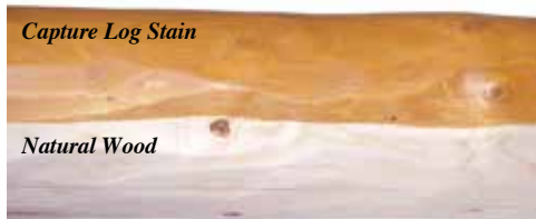
Capture Log Stain brings your logs alive as it enhances the unique character of the wood grain.

For more information on proper preparation and application methods, visit our website at www.sashco.com or scan the Tag on this brochure to access it from your smart phone or tablet.